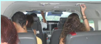
Inside the plane we rode in to RoatanTIGHT.. But good views

For our time at language school For safe travel of the YWAM team in the States For Health for all of our family members For Health of the YWAM team For our preparations to move to Honduras in June